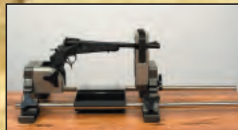
Wide Range of Adjustment