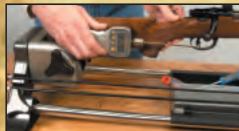
Wide Range of Uses