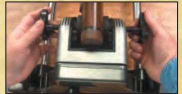
Secure, Padded Clamping