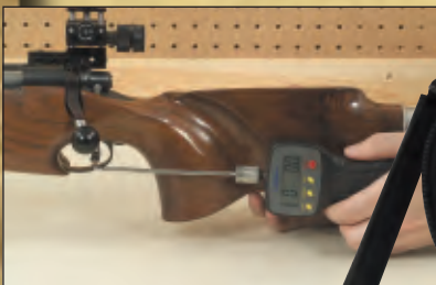
Accurate up to 1/10 of an oz.