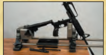
Holds Any Firearm